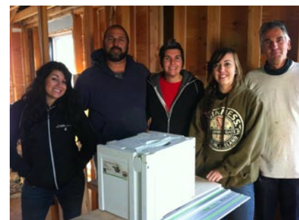
2011 Habitat for Humanity Project