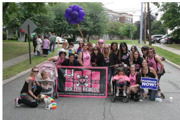
2011 Gay Pride Parade