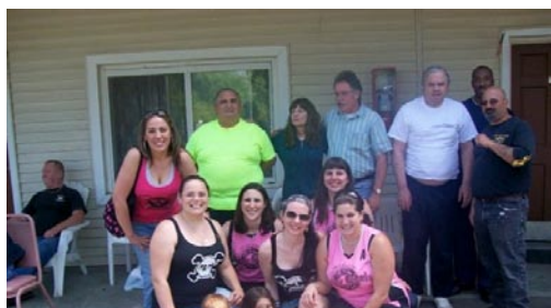
2009 BBQ - Roller Rebels Partner with LI Road Runners to Help Support Veterans